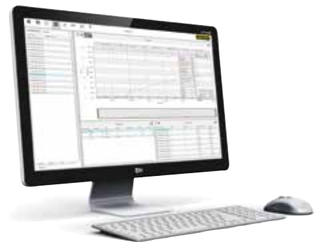
VCD Software for Control, Visualisation and Documentation