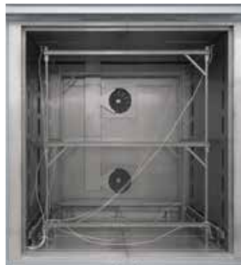
Pluggable frame for measurement for forced convection chamber furnace N 7920/45 HAS