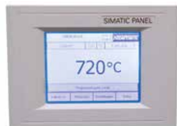
Precision of the controls, e.g. +/- 1K

In standard furnaces a temperature uniformity is guaranteed as +/- K without measurement of temperature uniformity. However, as additional feature, a temperature uniformity measurement at a reference temperature in the work space compliant with DIN 17052-1 can be ordered. Depending on the furnace model, a holding frame which is equivalent in size to the charge space is inserted into the furnace. This frame holds thermocouples at defined measurement positions (11 thermocouples with square cross-section, 9 thermocouple with circular cross-section). The temperature uniformity measurement is performed at a reference temperature specified by the customer at a pre-defined dwell time. If necessary, different reference temperatures or a defined reference working temperature range can also be calibrated.