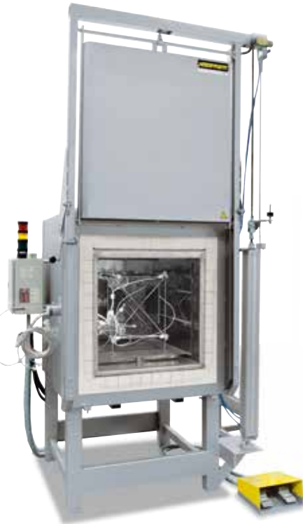
Holding frame for measurement of temperature uniformity

Temperature uniformity is defined as the maximum temperature deviation in the work space of the furnace. There is a general difference between the furnace chamber and the work space. The furnace chamber is the total volume available in the furnace. The work space is smaller than the furnace chamber and describes the volume which can be used for charging.