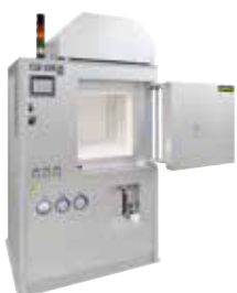
HT 160/17 DB200 for debinding and sintering of ceramics after 3D-printing