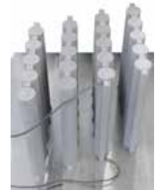
Titanium rods after heat treatment in NR 50/11 in argon atmosphere