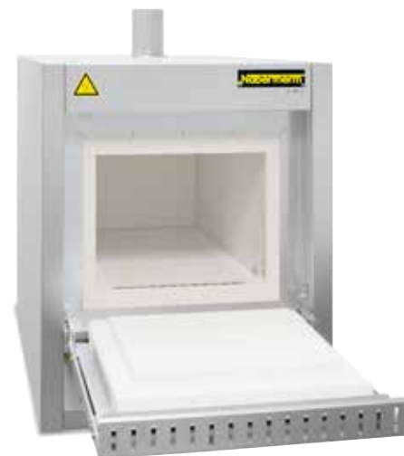
Muffle furnace L 40/11 BO with passive safety system and integrated post combustion for thermal debinding in air

2 The furnaces are available with different max. furnace chamber temperatures