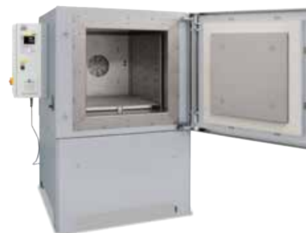
Forced convection chamber furnace NA 250/45 for heat treatment in air