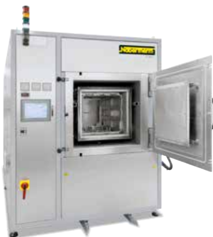
Cold-wall retort furnace VHT 100/12-MO for processes in high vacuum

Cold-wall retort furnaces are used for processes in protective gas at temperatures above 1100 °C or under vacuum above 600 °C.