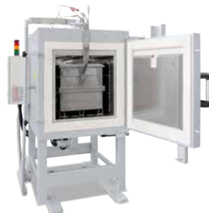
Forced convection chamber furnace N 250/85 HA with protective gas box for heat treatment in a protective gas atmosphere