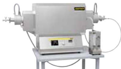
Compact tube furnace for sintering or annealing under protective gases or in a vacuum after 3D-printing