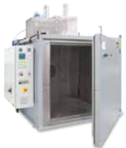
Chamber oven KTR 2000 for curing after 3D-printing