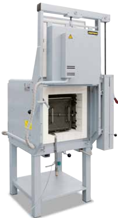
Chamber furnace LH 60/12 with protective gas box for heat treatment in a protective gas atmosphere