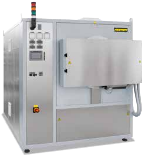
Hot-wall retort furnace NRA 150/09 for heat treatment in a protective gas atmosphere

With sensitive materials, such as titanium, the component may still oxidize due to the residual oxygen concentration in the protective gas box.