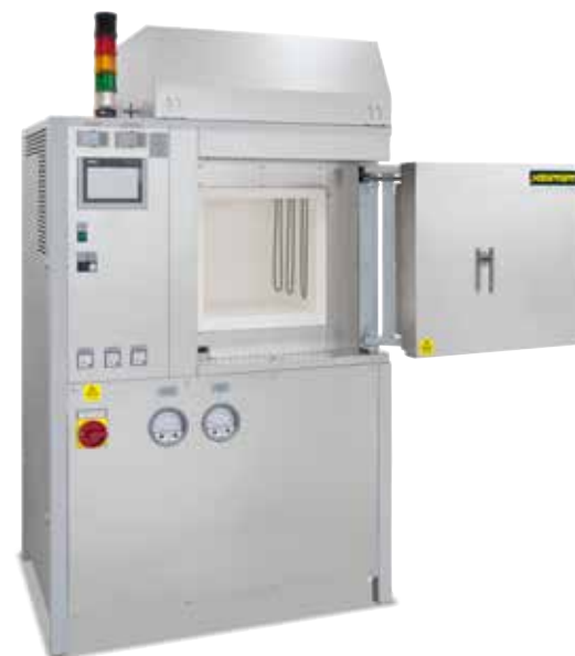
High-temperature furnace HT 64/17 DB100 with passive safety system for debinding and sintering in air

The table contains examples of furnaces which can be equipped with suitable safety technology. Hot-wall retort furnaces are used as debinding furnaces and cold-wall retort furnaces as sintering furnaces. Under certain circumstances, depending on the application, it is possible to use the same furnace for both processes.