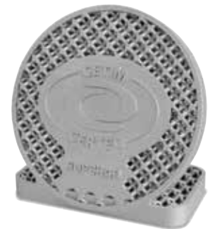
Printed aluminum part, heat treated in model N 250/85 HA (Manufacturer CETIM CERTEC on SUPCHAD platform)

This also applies to processes that are carried out in vacuum or in furnaces where a low residual oxygen concentration is important. For these furnaces, it is important that they are cleaned and maintained regularly. Even the smallest leak or contamination can produce an unsatisfactory result.