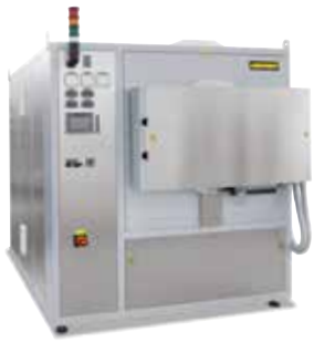
Retort furnace NR 150/11 for annealing of metal parts of 3D-printing

Additive manufacturing allows for the direct conversion of design construction files fully functional objects. With 3D-printing objects from metals, plastics, ceramics, glass, sand or other materials are built-up in layers until they have reached their final shape.